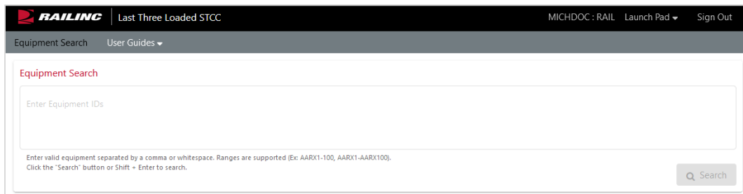
Exhibit 4. Equipment Search